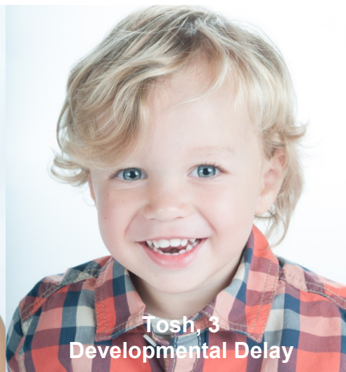
Tosh, 3 Developmental Delay